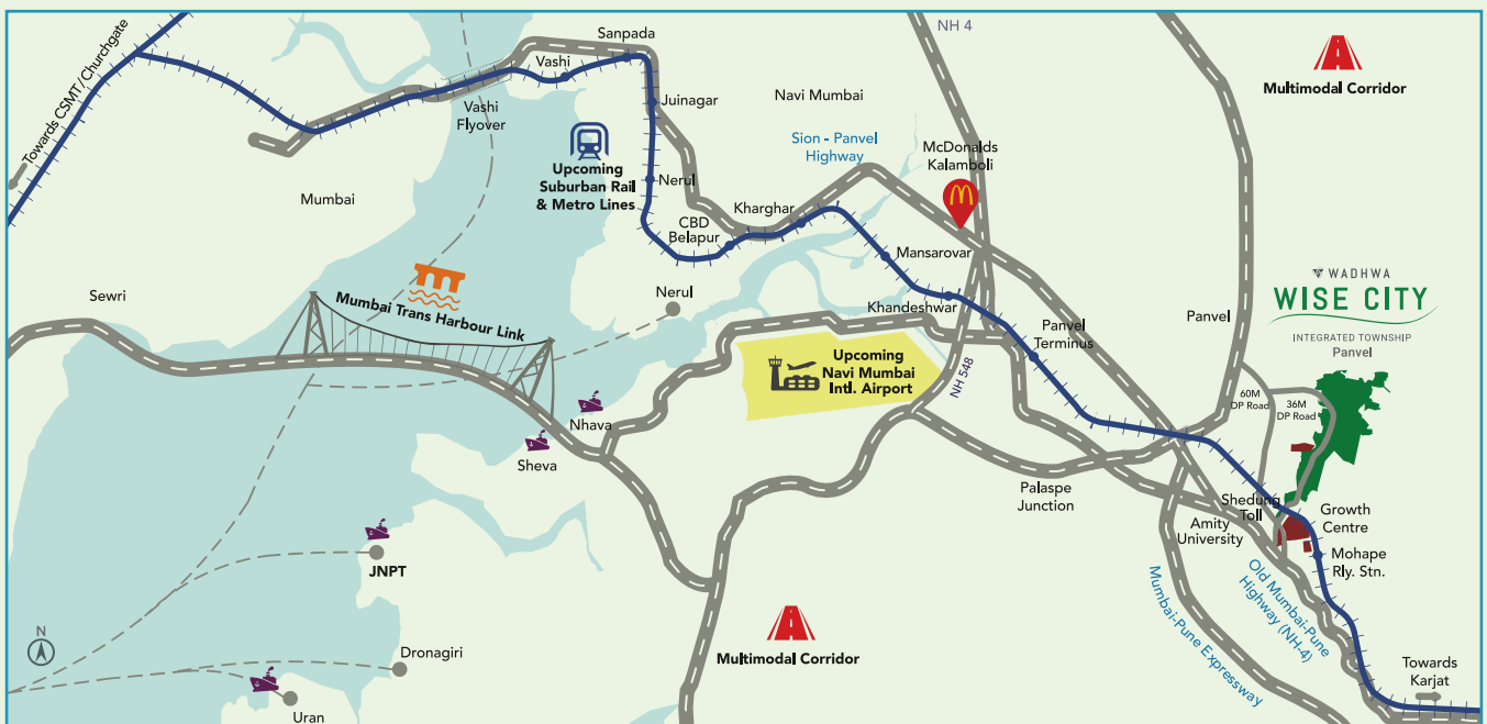
*Map is not in actual scale and is for reference only. Approximate distances and time calculated according to Google Maps.